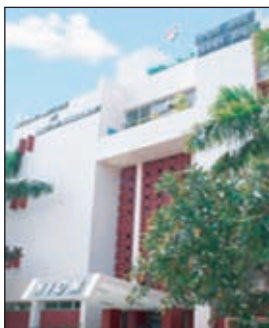
NATIONAL INSTITUTE OF DISASTER MANAGEMENT (NIDM)

Ministry of Home Affairs, Government of India